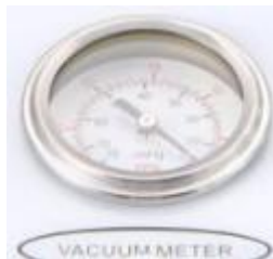
The indicator of vacuum pressure